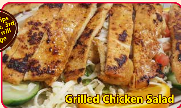
Grilled Chicken Salad

Try your salad with avocado slices for 2.49