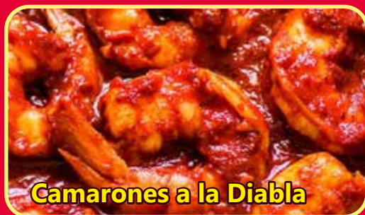
Camarones a la Diabla