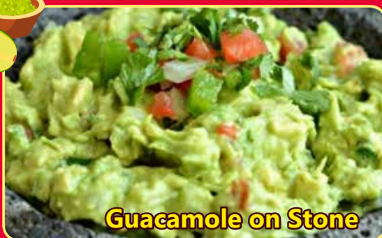
Guacamole on Stone