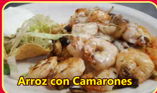
Arroz con Camarones